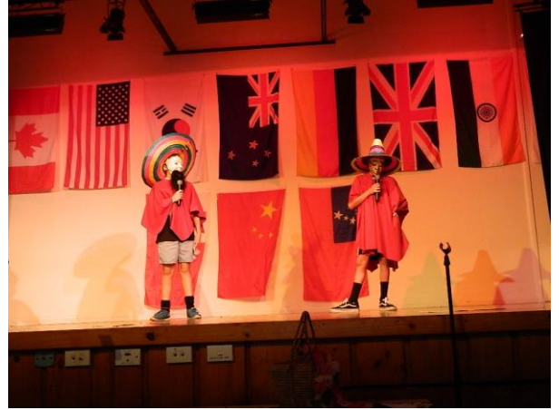
Celebrating our cultural heritage

Each year the school asks parents to give a voluntary 'donation'. This funding supports the many extras the school provides in specialised and progressive teaching programmes. Thank you to all families who have supported the school in this manner – without the extra funding we would not be able to provide the high standard of education that is expected by our community. It is not too late to pay your donation if you have not already done so.